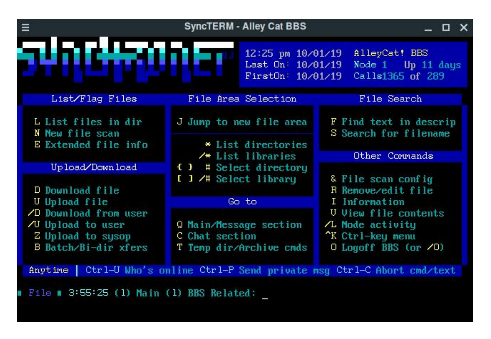
Figure 3: Files

ALTERANT wouldn't let me finish registration and that sucks, because I was really looking forward to trying it out... if you know where to get in touch with the SysOp and let them know that registering doesn't work, drop me a line!