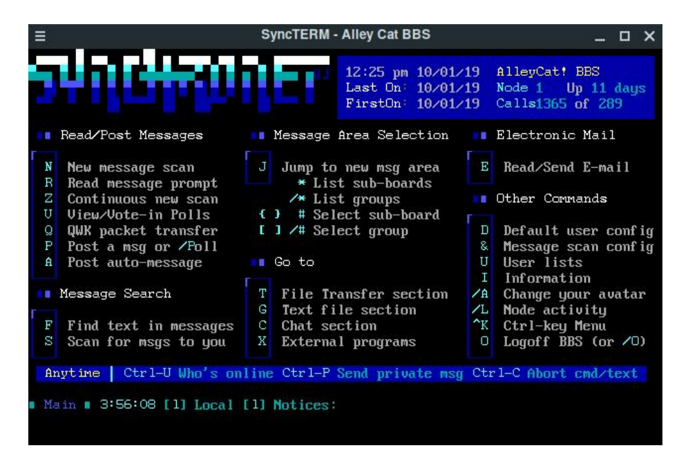
Figure 1: Main menu